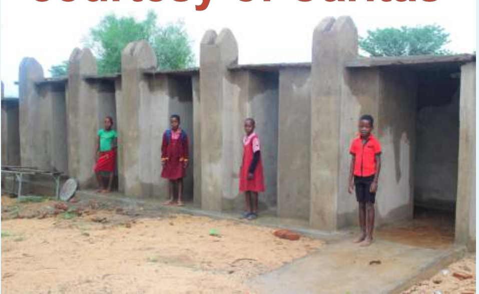
Pupils at Tonhorai Primary School enjoy the comfort of new toilets.

Because of the devastating effects of Cyclone Idai, many schools in Chimanimani, Chipinge, Buhera, Chikomba and Masvingo had their infrastructure destroyed. Most of the schools' latrines collapsed leaving children to resort to the bush to relieve themselves. This saw Caritas coming in to build institutional latrines for schools to enhance children's hygiene. One good example is Tonhorai Primary School where Caritas helped build ten squat hole latrines with a disability compartment