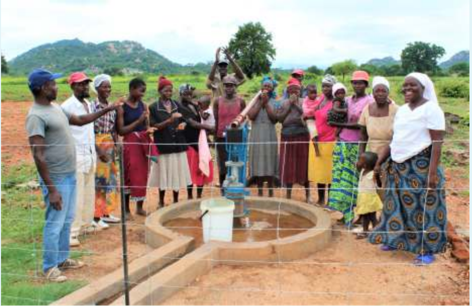
Residents of Manyengavana village celebrate the resuscitation of their borehole by Caritas. The borehole also serves to water their livelihoods garden below.