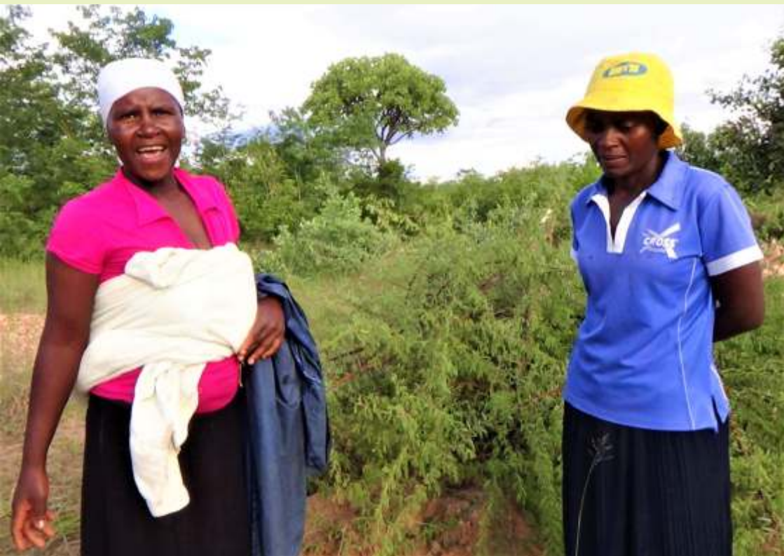
Two women celebrate at a borehole site protected by thorn branches after drilling at Hakuna village, Buhera.

heavily impacted on women who had to travel long distances to fetch water for domestic purposes and for children to bath. At each borehole, water point committees were established for sustainable management of the facility and also, committee members were trained in Participatory Health and Hygiene Education (PHHE).