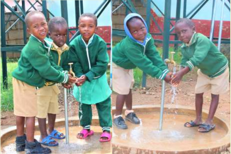
Learners at Makwau Primary school enjoy safe and clean water after Caritas installed a solar pump for the school.

W hile buildings crumbled, roofs got blown away and people were left stranded, Makwau Primary school's borehole pipes collapsed leaving the school without water for months. Truly, a Cyclone can bring different forms of suffering. Both teachers and students contemplated on where the school would get water. Little did they know that a "Good Samaritan", Caritas was coming with a better and technologically advanced solution to their problem. Instead of reinstalling the usual and commonly used hand pump, Caritas installed a solar pump and erected water tanks at Makwau Primary, a school back of the beyond