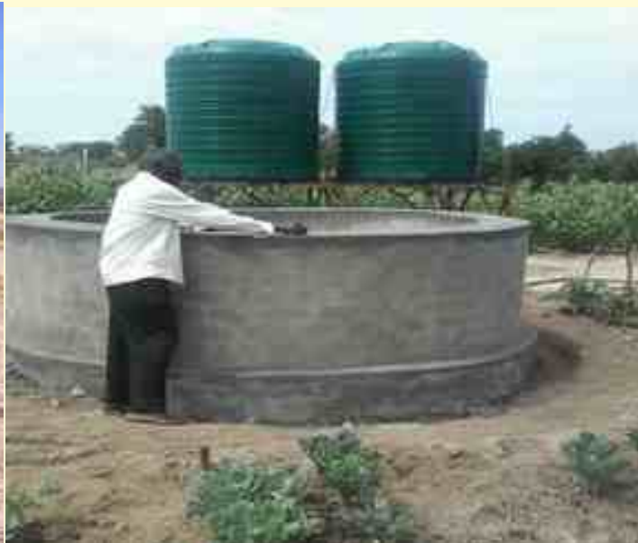
Community members digging a trench to connect water from a drilled and powered borehole. Communities produce crops using water from the drilled borehole.