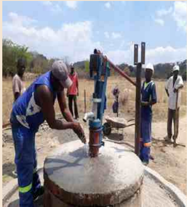
Caritas Mutare's Cyclone response: Rehabilitation of dip wells and spring protection in Manicaland, Buhera district, ward 19.