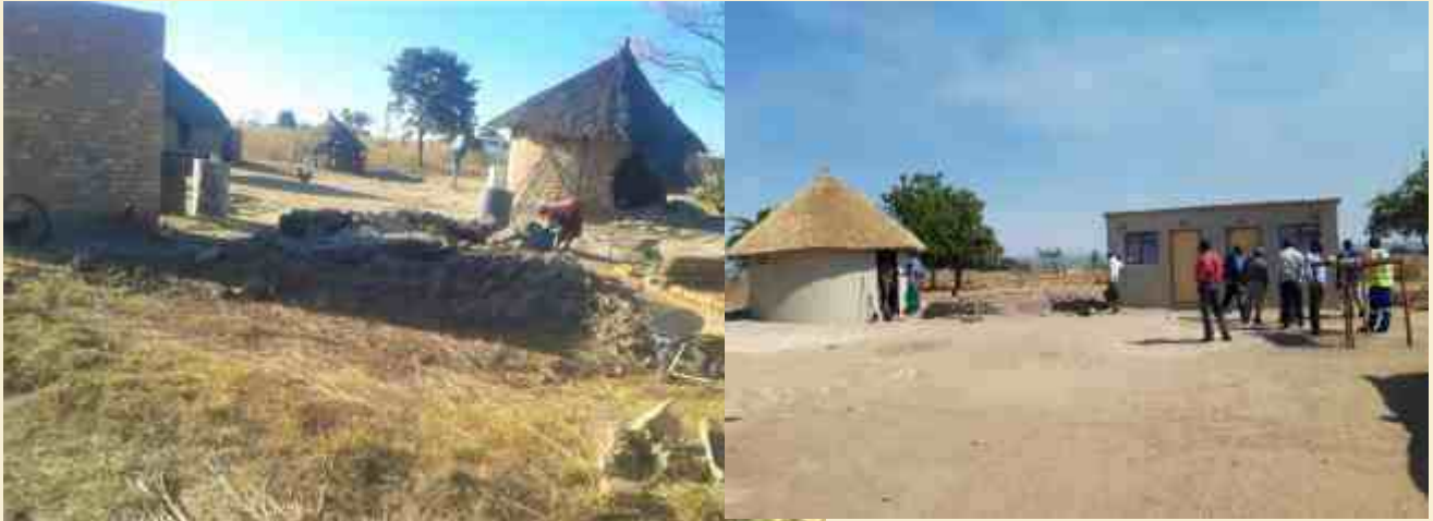
Above: left picture 50 yrs Mrs. Shindi of mash East, Chikomba district, ward 15, Gumbe village with her collapsed huts, as a result of the Cyclone Idai, right picture with the shelter intervention she now has a two roomed house, a kitchen and toilet. (building back better)