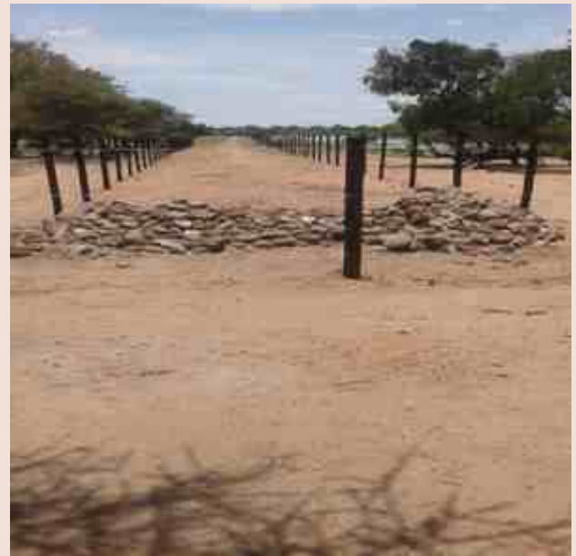
Above: Caritas' Food for Assets program shows works as people were fencing the embankment at Mahlasela Dam as well as carrying out conservation works to protect the dam in ward 8 Bidi area of Matobo District.

In Hwange Dioceses the Food for assets programme saw the extension of water pipeline from Siakancele to Bhotela village in Tyunga ward in Binga benefitting 4068 people. The program also saw the construction of toilet and installation of showers at the waiting mothers' shelter at Sinamunsanga clinic as well as construction of toilets and bathrooms at Tyunga and Kalungwizi clinics in Binga district.