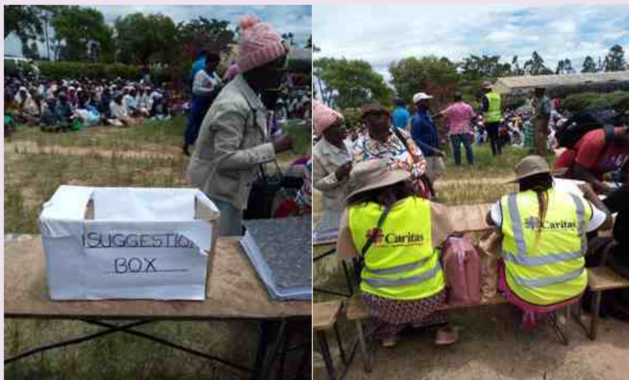
Caritas Mutare distributes food items to beneficiaries in Chikomba district ward 19.

The Caritas Chinhoyi dioceses with support from Jesuit Mission Germany under emergency food assistance provided 840 HHs with food assistance to the ten mission stations in their area in the year 2019. The Diocesan Caritas offices of Masvingo, Mutare and Archdioceses of Harare also distributed emergency food relief including Non-Food items (NFIs) to the victims of cyclone Idai in the year.